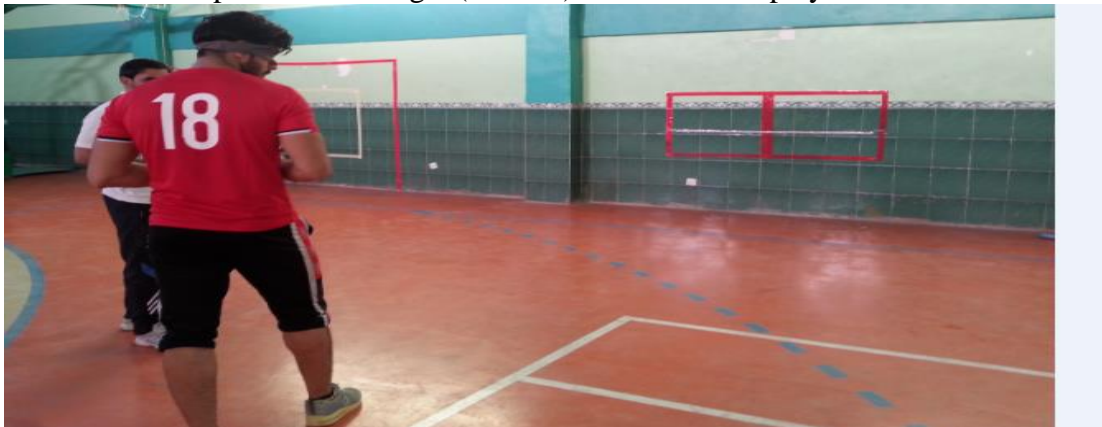
(Figure 2) perception of direction test

*The purpose of test: To measure the perception of direction