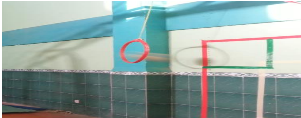
(Figure 1) perception of speed test

*The purpose of test: To measure the perception of speed