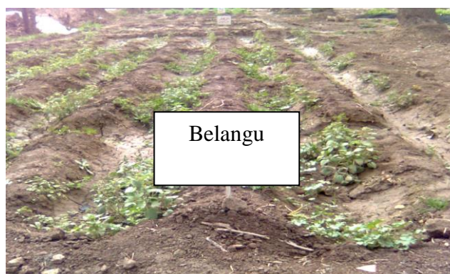
Figure 1: Experimental cultivation of Belangu plant ( Lallemantia royleana )

The plant samples were chosen from the middle rows of each plot randomly, the growth parameters as biometric indicator were included plant height, number of branches on plant and dry leaf weight (plate1) as shown in Figure 1.